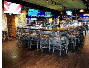
MAIN DINING ROOM BAR