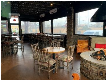
INDOOR PATIO & FIRE PIT