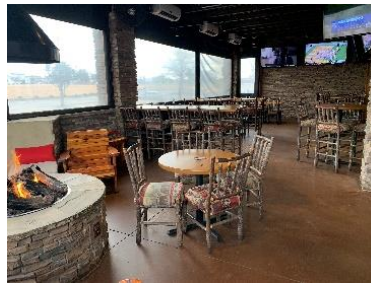
INDOOR PATIO & FIRE PIT