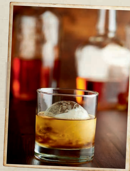
MADISON HEIGHTS 0818